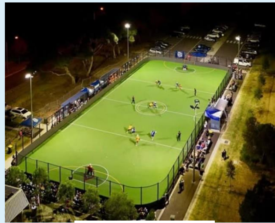
Alan Lewer Box Court

Altona is recognised as Australia's centre for box lacrosse, boasting the country's only court designed specifically for the sport. The Altona Lacrosse Club also hosts many national and international indoor lacrosse competitions.