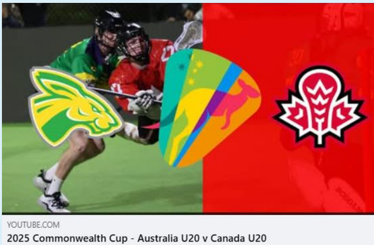
YOUTUBE.COM 2025 Commonwealth Cup - Australia U20 v Canada U20

Our fields and clubrooms are in demand all year round and are often used for selection and training by Australian and Victorian Lacrosse teams. Altona Lacrosse Club is also a regular host for lacrosse finals in Victoria.